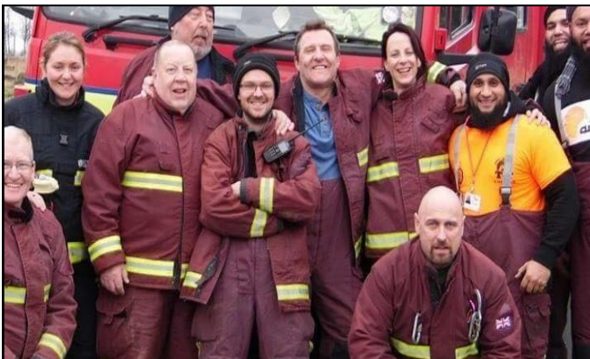
Visiting firemen and mosque volunteers helping following the floods

Details of events and updates about progress can be found on: www.hope-baptist.org.uk & https://www.facebook.com/groups/HopeChapelHebdenBridge/